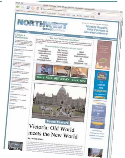
Getaway Media Corp's Northwest Travel Advisor website

The site is highly optimized to guarantee top placements in several search engines and aggressive print promotion also brings many first-time visitors. But the site also places a high emphasis on generating return visits. For example, the heart of the site is the “Getaway Machine,” a calculator that matches Pacific Northwest destinations with up to 40 parameters chosen by the website visitor. The traveler is able to click on a “type” of getaway – “romantic,” for example – and be whisked away to a quick and easy form that allows the visitor to check more specific desires such as waterfront access, shopping, city versus country, scenic, historic, cultural and several other parameters. The calculator then factors in price, distance and activities – all preferences given by the visitor – to report back a list of getaways that most closely match the visitor’s criteria.